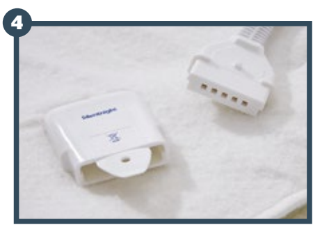
A. Mattress B. Electric blanket