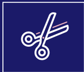
Sharp Pointed Scissors