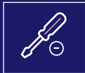
Flat Head Screwdriver