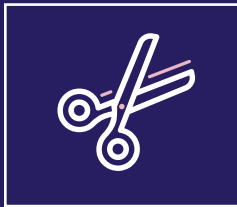
Sharp Pointed Scissors